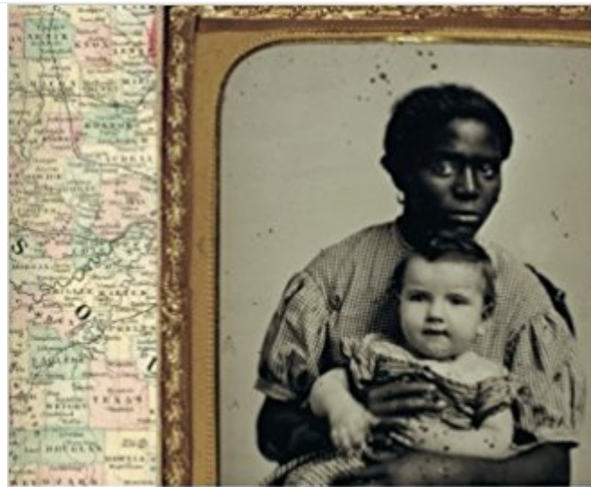
Missouri's Small-Slaveholding Households, 1815-1865